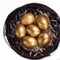
Investment Hall 投融資館