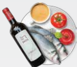
Food Trade Hall 食品貿易館