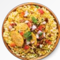
Halal Food Hall 清真食品館