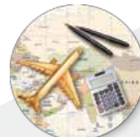
Professional Service Hall 專業服務館