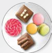
Snack Food Hall 零食品牌館